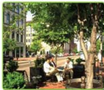
Streetscapes & Public Art