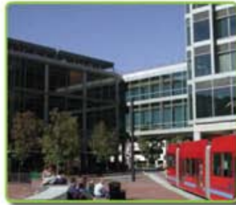
Transit & Transportation Infrastructure 22 mile loop