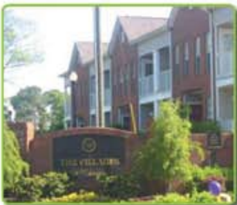
Affordable Workforce Housing