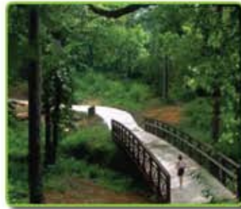
Trails 33 miles