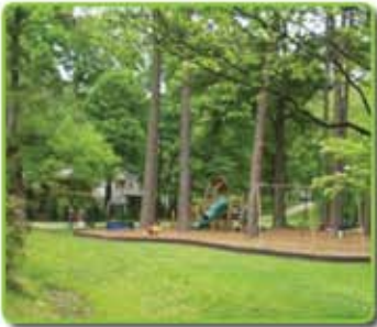
Parks 1300 new acres