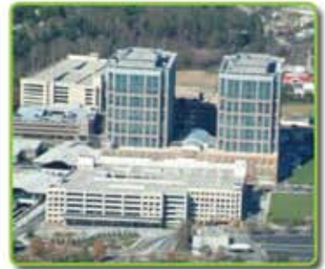
Jobs & Economic Development 20 areas, 30k jobs